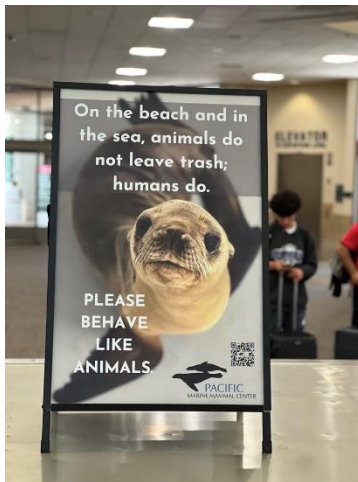
Baggage claim display encouraging visitors to be conscious consumers.

Orange County, CA — Pacific Marine Mammal Center (PMMC), a leader in the rescue, rehabilitation, and release of marine mammals, and ocean stewardship, is thrilled to announce a partnership with John Wayne Airport aimed at fostering environmental awareness and stewardship among travelers passing through Orange County.