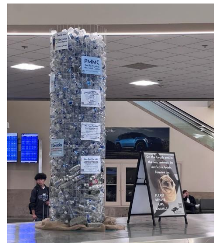
Tower displaying facts about how single-use plastics are detrimental to our environment and marine life.